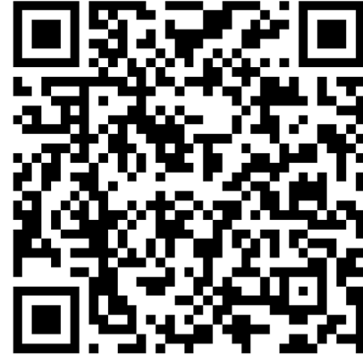
Scan this QR code to submit a question for the 3/19/25 Special Meeting